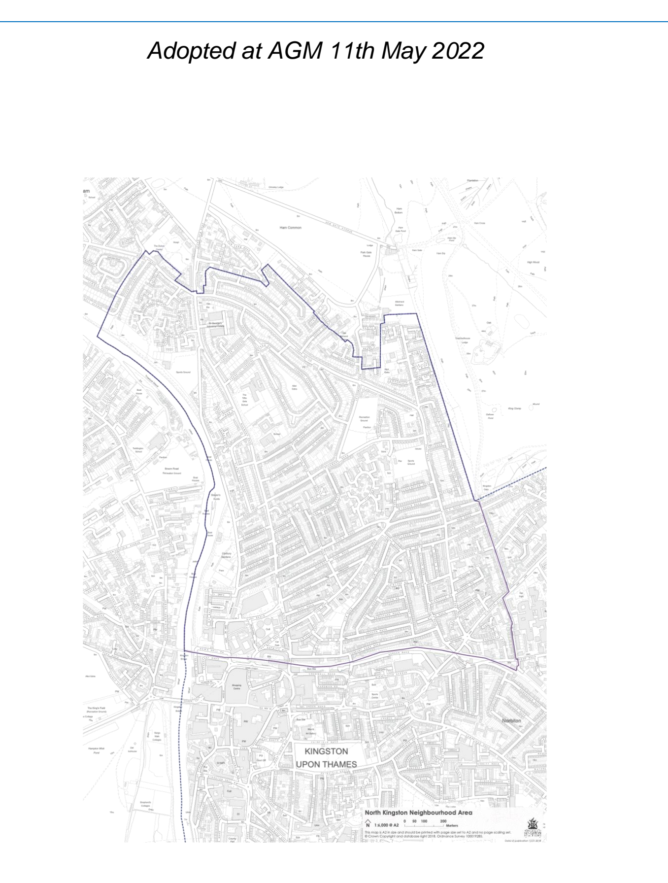
Boundary Map of the North Kingston Forum Neighbourhood Area

Many thanks to Kingston Council in the preparation of this map