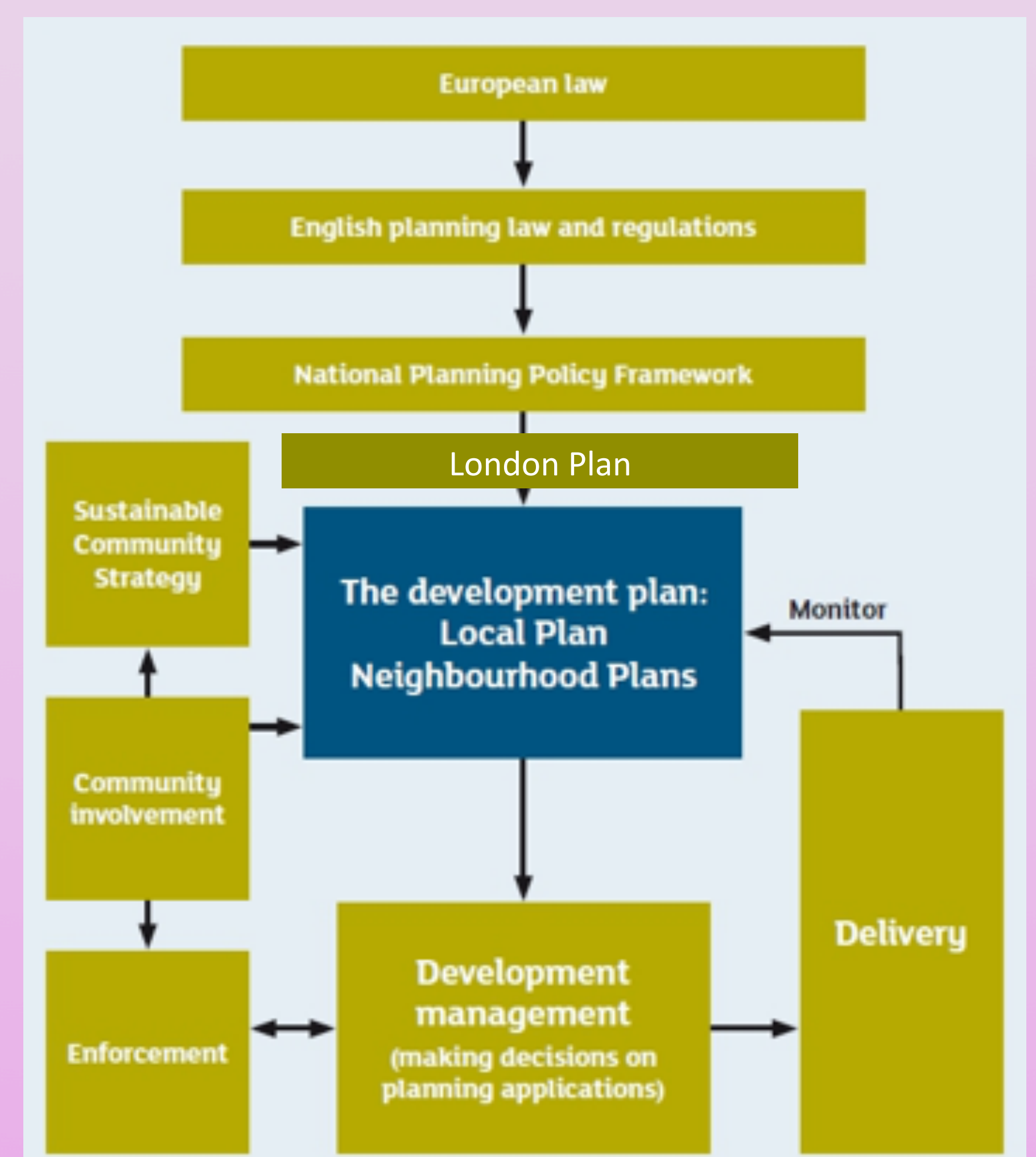
Adapted from CPRE Planning Help